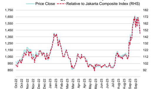
Medco Energy International (MEDC IJ)