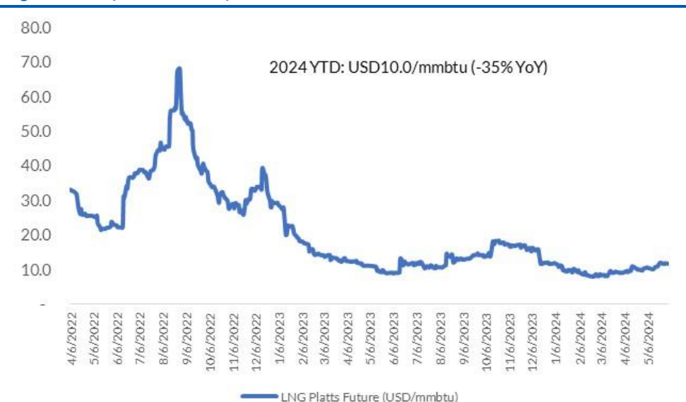
Figure 3: LNG prices as of May 2024