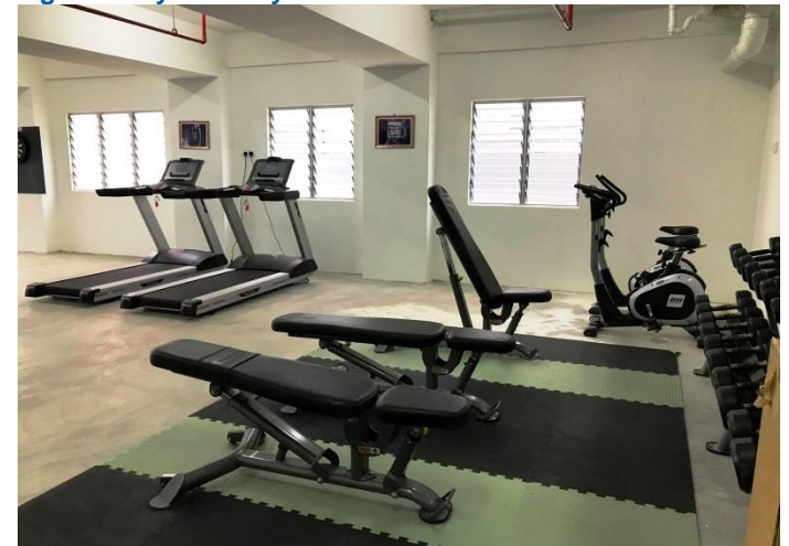
Figure 4: Gym facility