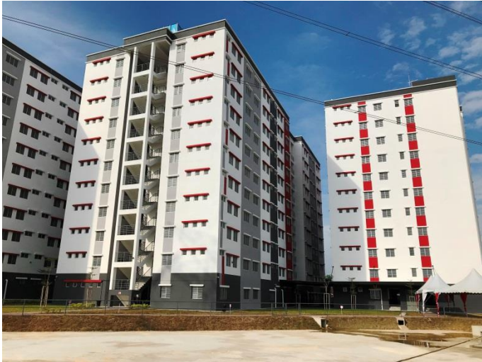
Figure 1: Centurion's PBWA in Penang