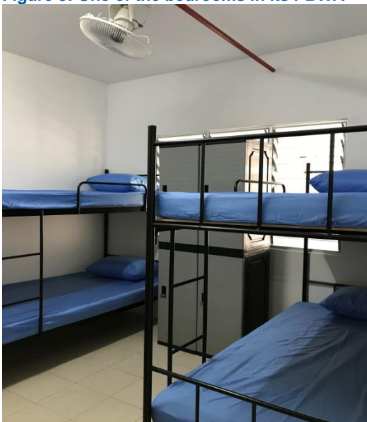
Figure 5: One of the bedrooms in its PBWA