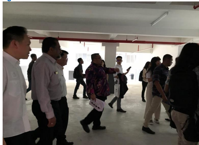
Figure 3: Site tour