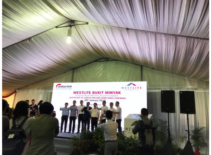
Figure 2: Certificate of completion and compliance ceremony