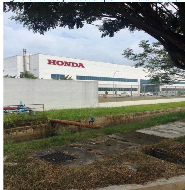
Figure 6: Honda production plant in Batu Kawan, Penang